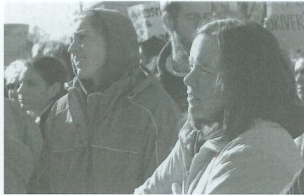
Creighton students rally with OTOC for immigrant driver’s certificates.

Concentrating on worker safety, food security, and just wages, OTOC supported the right of the meat-packing employees to vote on whether to unionize. Volkmer says OTOC brought together people from all over Omaha to push for a new sewer system in the oldest part